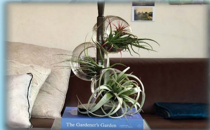
Air Plant Collection Tillandsia spp.