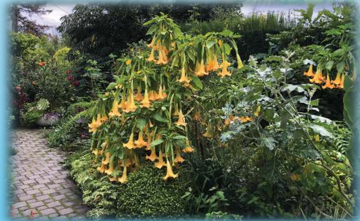
Angel Trumpets Brugmansia suaveolens