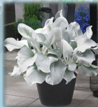
Angel Wings® Senecio Senecio candicans