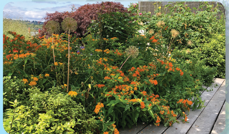
Butterfly Bouquet Collection Asclepias sp.

We aren't happy if you aren't happy. If you have any questions regarding your order please call us at 1-800-428-9726 during the hours of 8:30 am and 4:30 pm EST. You can email questions to us at: plantquestions@robertasinc.com .