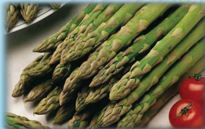
Asparagus Asparagus Officinalis

Thank You for bringing us into your home