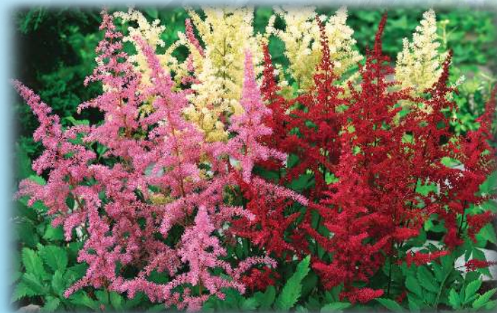
Astilbe or False Spirea Astilbe

Thank You for bringing us into your home