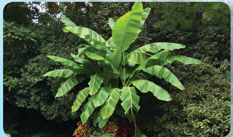
Winter Hardy Banana Musa basjoo

We aren't happy if you aren't happy. If you have any questions regarding your order please call us at 1-800-428-9726 during the hours of 8:30 am and 4:30 pm EST. You can email questions to us at: plantquestions@robertasinc.com .