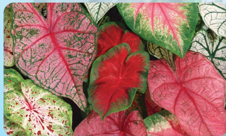
Fancy Leaf Caladium Mix Caladium

We aren't happy if you aren't happy. If you have any questions regarding your order please call us at 1-765-525-4065 during the hours of 8:30 am and 4:30 pm EST.