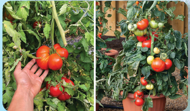
Caprese Tomato & Basil Collection Solanum lycopersicum & Ocimum basilicum

We aren't happy if you aren't happy. If you have any questions regarding your order please call us at 1-800-428-9726 during the hours of 8:30 am and 4:30 pm EST. You can email questions to us at: plantquestions@robertasinc.com .