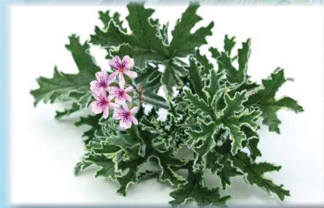
Citronella Scented Geranium Collections Pelargonium citrosum