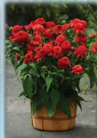
Echinacea Double Scoop™ Echinacea hybrid