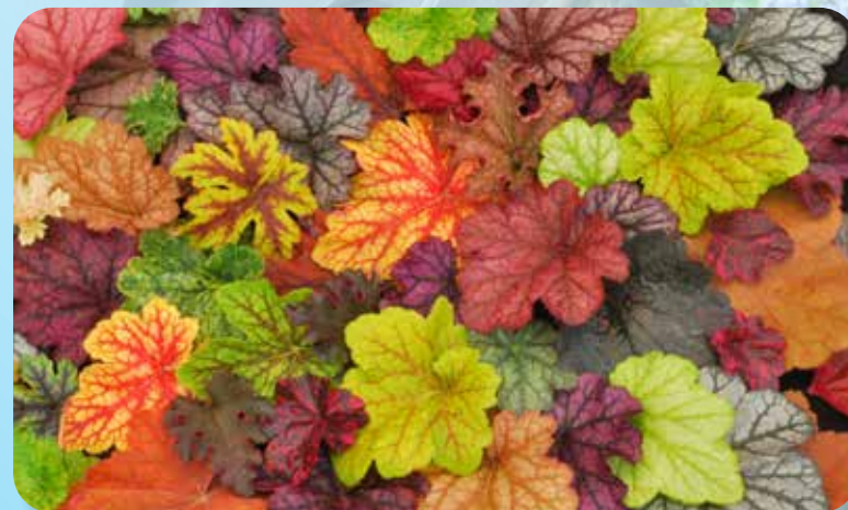
3pc Coral Bells Heuchera hybrids

We aren't happy if you aren't happy. If you have any questions regarding your order please call us at 1-765-525-4065 during the hours of 8:30 am and 4:30 pm EST.