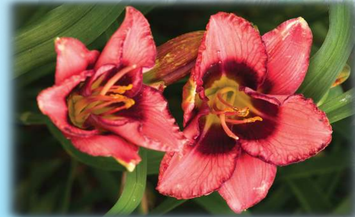
Fragrant & ReBlooming Daylily Hemerocallis hybrids