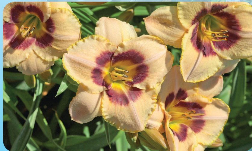
Daylily Collection Hemerocallis hybrids