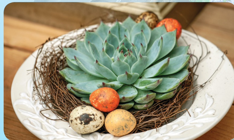
Echeveria Succulents Echeveria agavoides

We aren't happy if you aren't happy. If you have any questions regarding your order please call us at 1-800-428-9726 during the hours of 8:30 am and 4:30 pm EST.