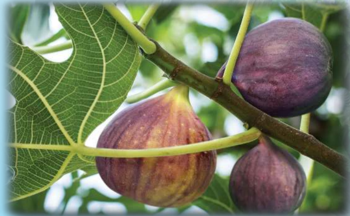
Hardy Fig Tree Ficus carica