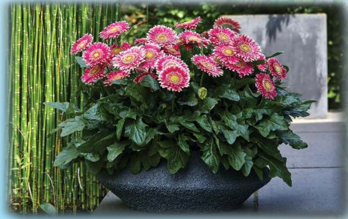
Jumbo Patio Gerber Daisies Gerbera hybrids