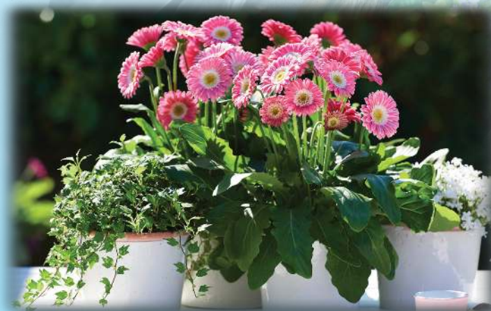
Garvinea® Sunny & Sweet Hardy Gerber Daisies Gerbera hybrids