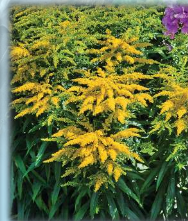
Little Lemon® Goldenrod Solidago hybrida