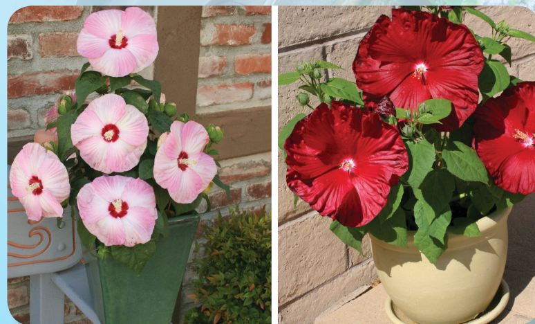
Honeymoon Hibiscus Hibiscus moscheutos

We aren't happy if you aren't happy. If you have any questions regarding your order please call us at 1-800-428-9726 during the hours of 8:30 am and 4:30 pm EST. You can email questions to us at: plantquestions@robertasinc.com .