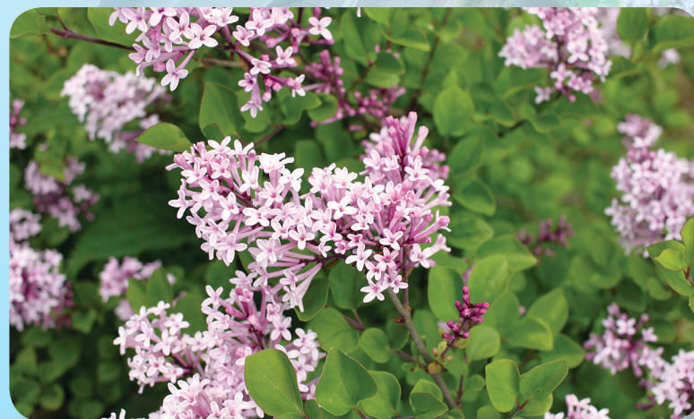
Summer Blooming Chinese Lilac Leptodermis oblonga

Thank You for bringing us into your home