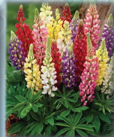
Gallery Series Lupine Lupinus hybrida