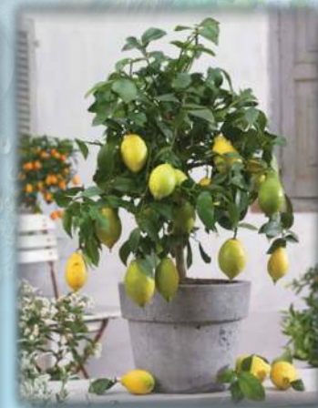
Meyer Lemon Citrus x meyeri