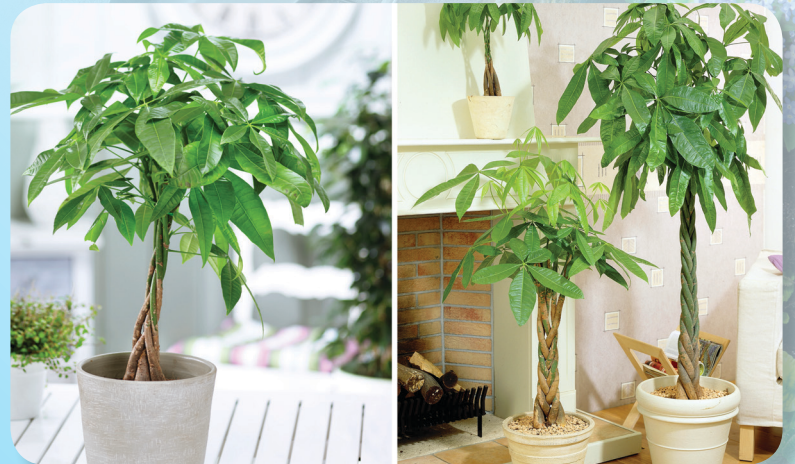
Braided Money Tree Pachira aquatica

We aren't happy if you aren't happy. If you have any questions regarding your order please call us at 1-800-428-9726 during the hours of 8:30 am and 4:30 pm EST. You can email questions to us at: plantquestions@robertasinc.com .