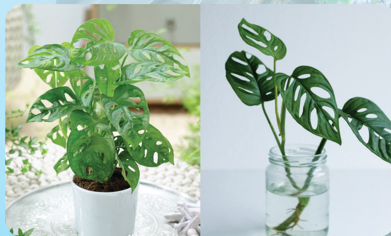
Monstera Swiss Cheese House Plant Monstera adansonii

We aren't happy if you aren't happy. If you have any questions regarding your order please call us at 1-800-428-9726 during the hours of 8:30 am and 4:30 pm EST. You can email questions to us at: plantquestions@robertasinc.com .