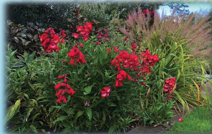
Penstemon Rondo Mix Penstemon barbatus