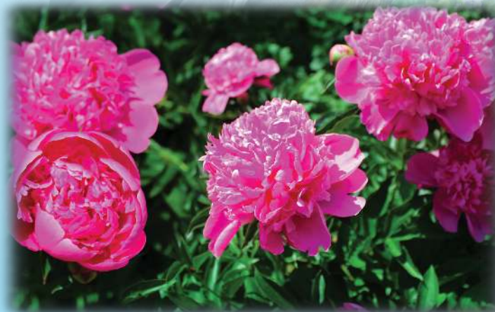
Garden Peony Collection Paeonia lactiflora