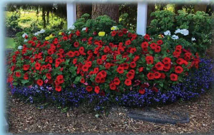
Mambo Groundcover Petunias *GP* Petunia multiflora