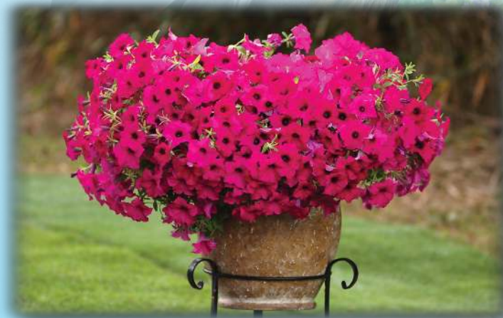
Sumo™ Petunias Petunia hybrida