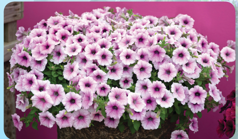
Surfinia® Series Petunia Collection Petunia multiflora

We aren't happy if you aren't happy. If you have any questions regarding your order please call us at 1-800-428-9726 during the hours of 8:30 am and 4:30 pm EST.