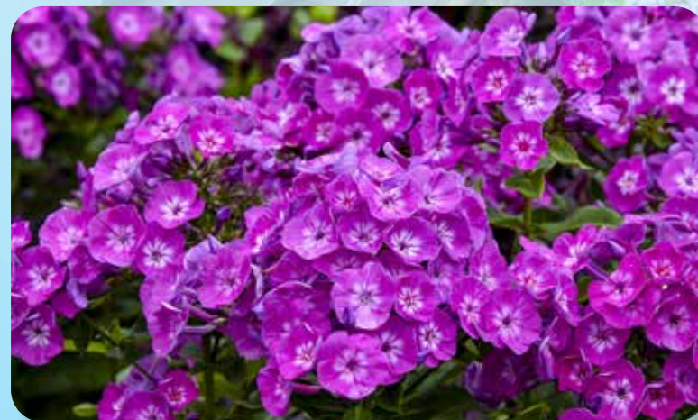
3pc Large Flowering Phlox Phlox paniculata hybrids

We aren't happy if you aren't happy. If you have any questions regarding your order please call us at 1-765-525-4065 during the hours of 8:30 am and 4:30 pm EST.