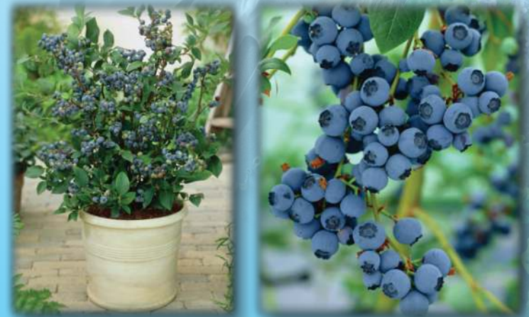
Polaris Patio Blueberry Bush Vaccinium corymbosum