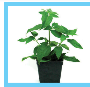
Shipped As Shown