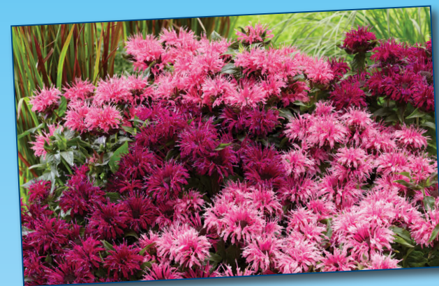
Sugar Buzz® Series Bee Balm (Mondarda didyma hybrids)