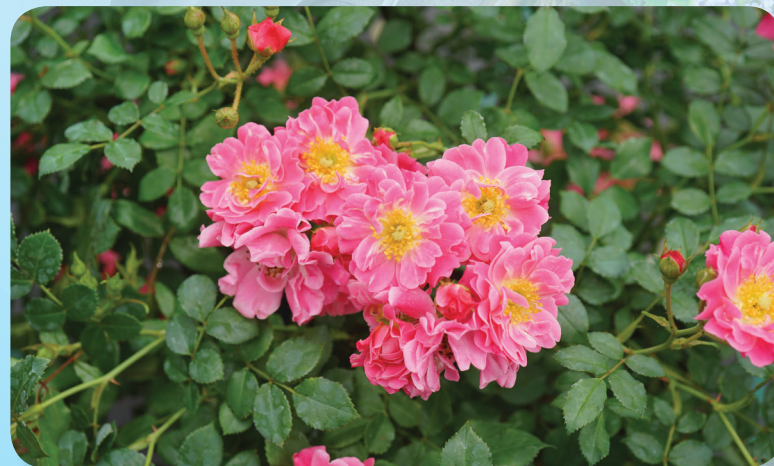
Proven Winners® OSO Easy® Roses Rosa hybrida

Thank You for bringing us into your home