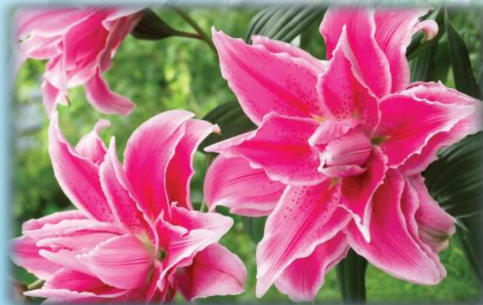
Multi Petal Oriental Lily Lilium orientalis hybrids