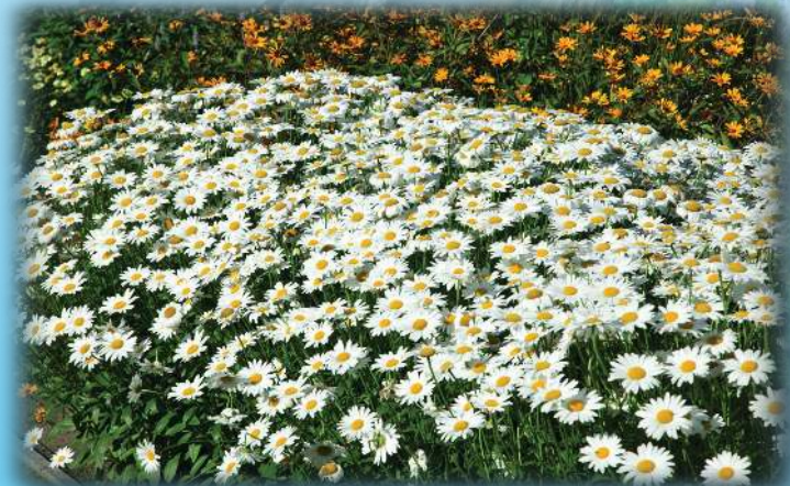
'Whoops-a-Daisy' Shasta Daisy Leucanthemum superbum