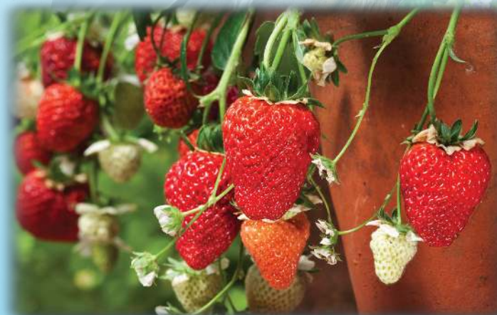
Toscana Patio Strawberry Fragaria x ananassa