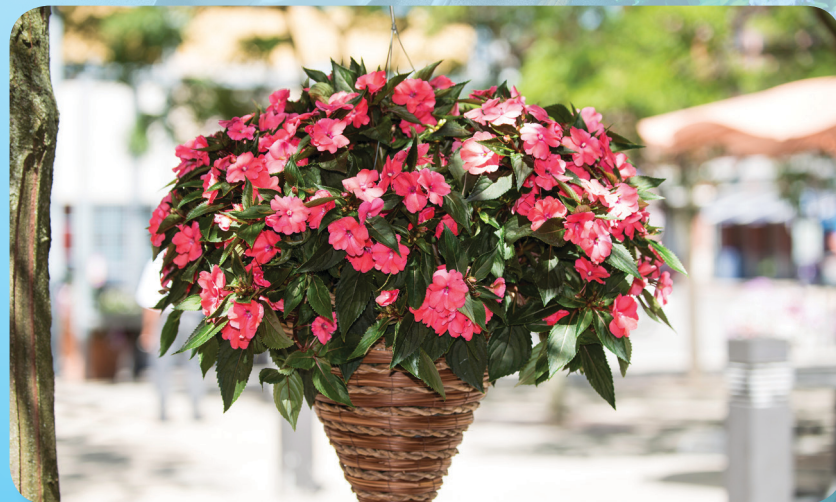
SunPatiens® Lovebirds Collection Impatiens spp.