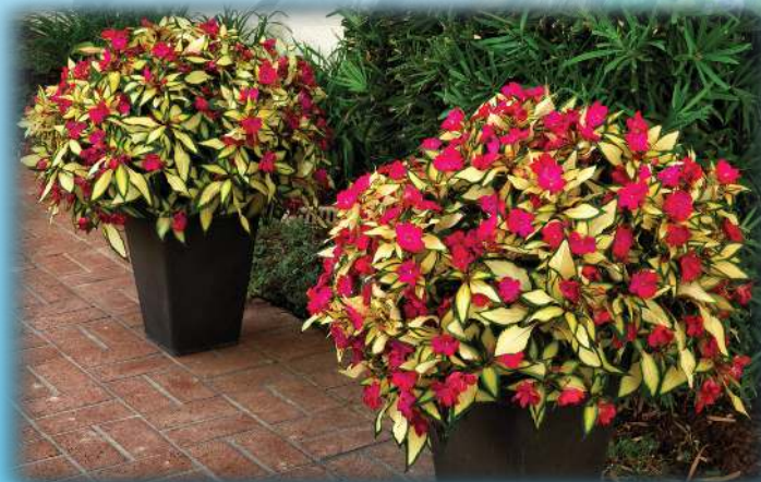
SunPatiens® Tropical Lightning Collection Impatiens spp.