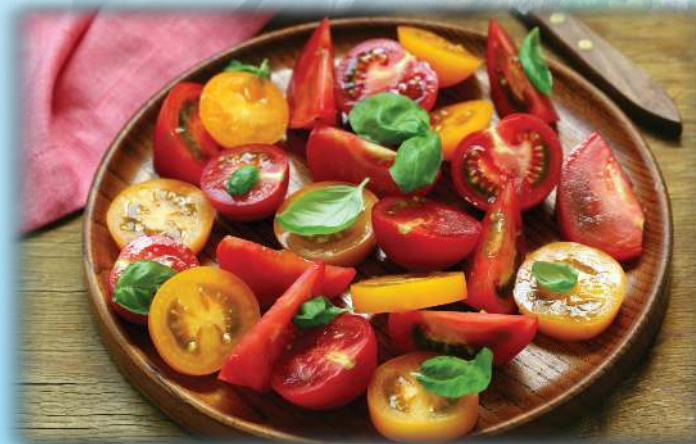
Vegetalis Cherry Tomatoes Solanum lycopersicum