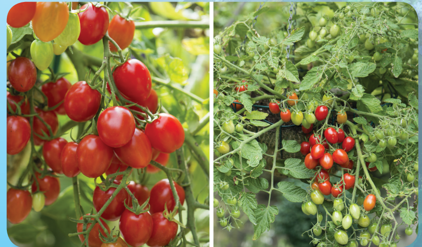
Cherry Tomato Collection Solanum lycopersicum