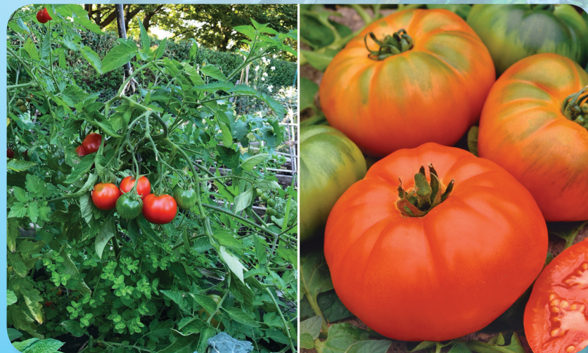
Tasty Tomato Collection Solanum lycopersicum

"Magic isn't so much what you create, it's what you notice."