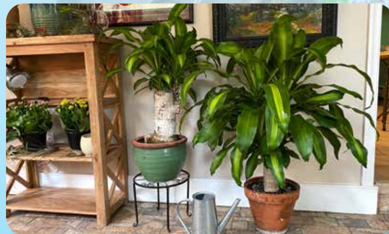
Good Luck Oriental Totem Pole Dracaena fragrans

We aren't happy if you aren't happy. If you have any questions regarding your order please call us at 1-765-525-4065 during the hours of 8:30 am and 4:30 pm EST.